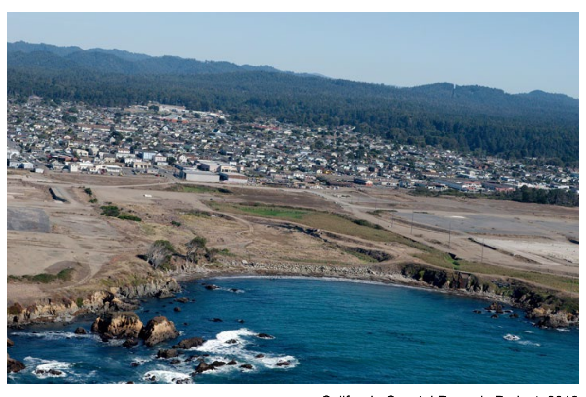
California Coastal Records Project, 2013