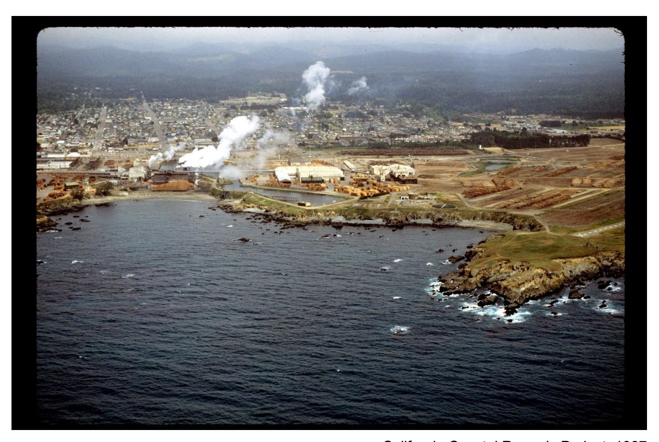
California Coastal Records Project, 1987