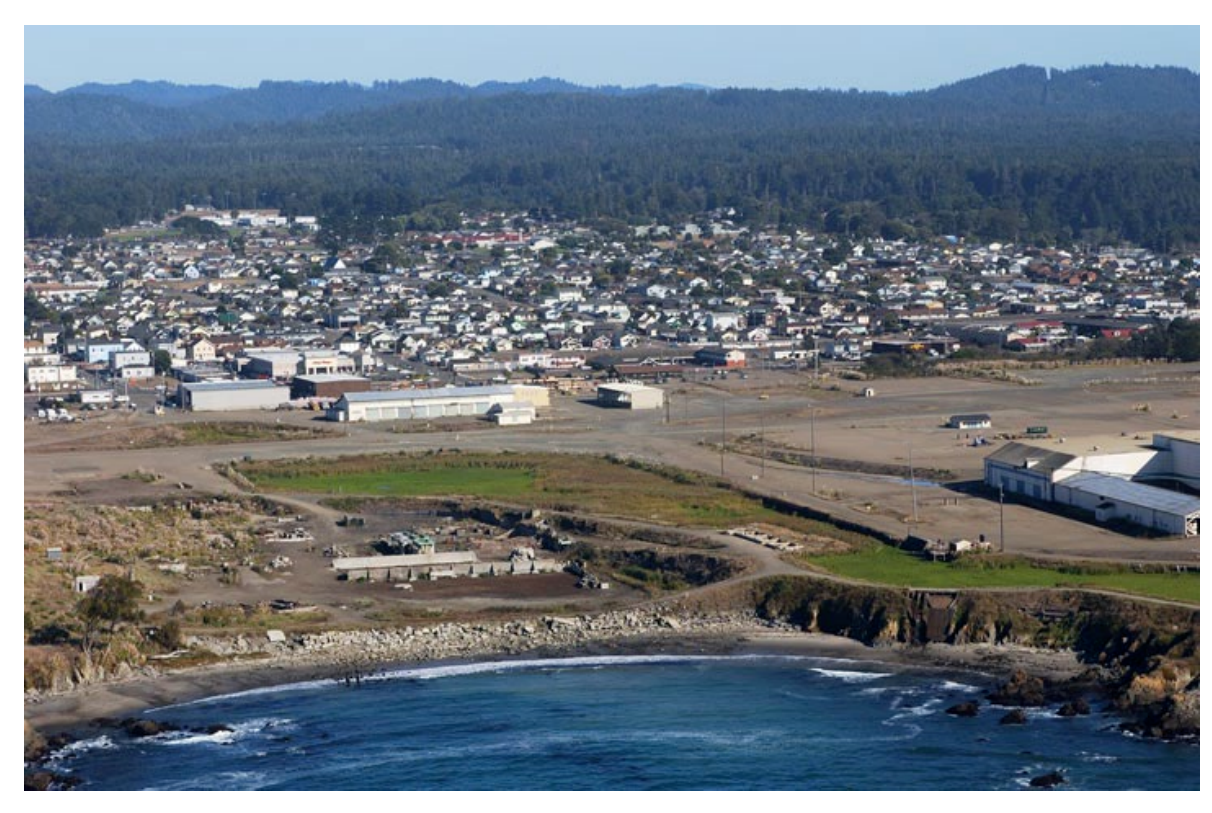
California Coastal Records Project, 2005