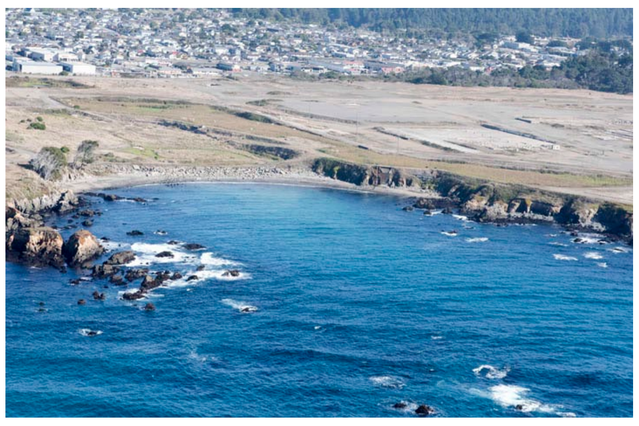
California Coastal Records Project, 2019